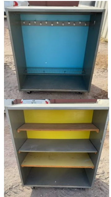
Storage Units - $15 each