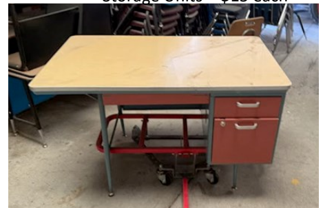
3 - single pedestal desk - $20 each