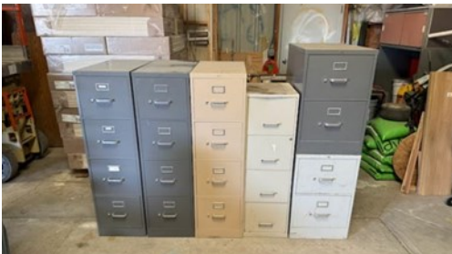
Filing Cabinets: 4-drawer $15/2-drawer $10