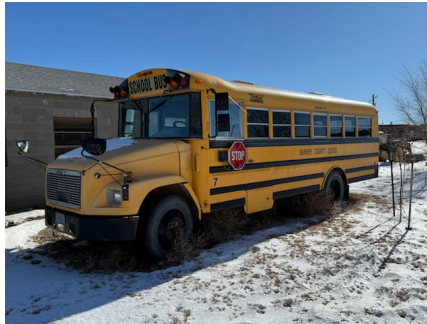
2001 Thomas/Freightliner Bus 189,364 miles Manual transmission CAT 3126 6 cyl. 7.2l engine Needs starter +? $2000 or best offer