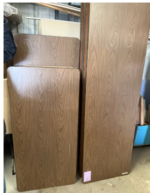
5', 6'Tables—$10 10' Tables—$15