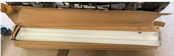
5 - two-lamp T-8 light fixtures - $5 each