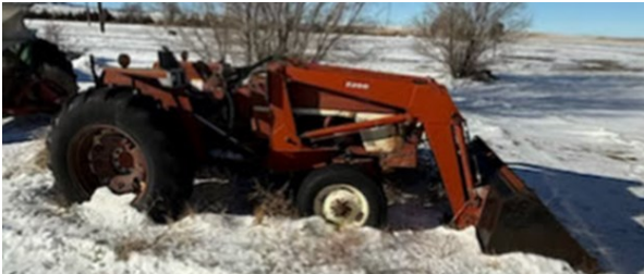
1975 International tractor Model 574 w/loader Needs clutch, battery, starter, tires. $2,500 or best offer