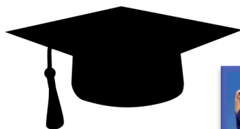
CLASS OF 2038