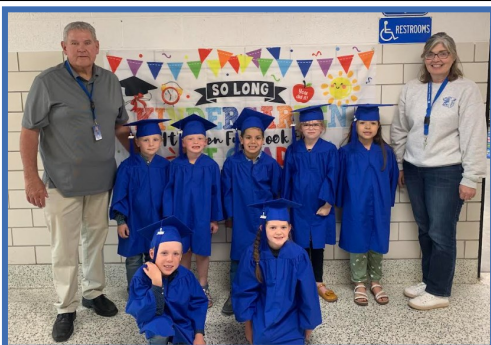
CLASS OF 2037